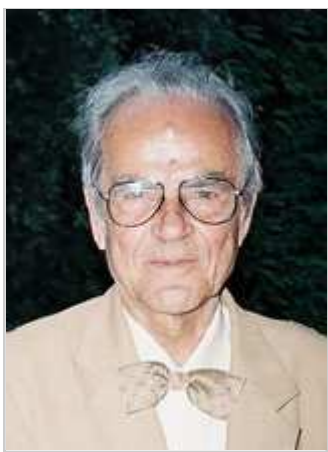
Figure 1: Boris Chirikov, June 6, 1998