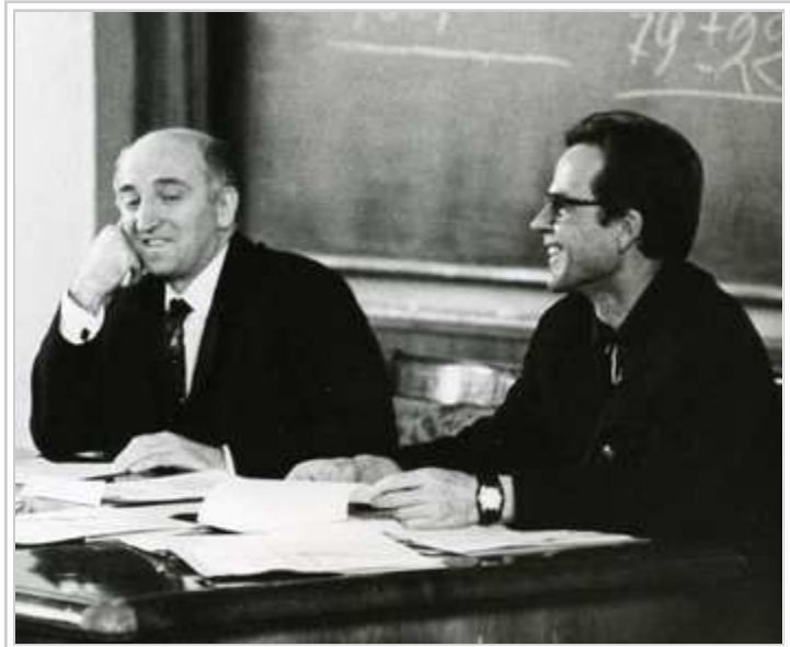
Figure 2: G.I. Budker and B.V. Chirikov, INP, around 1972

Chirikov was admitted to the Moscow Pedagogical Institute, and in the second year became a student at the recently created Department of Physics and Technology at Moscow State University (which later became the Moscow Institute of Physics and Technology, MIPT). He did his undergraduate and master studies there, and continued his experimental studies at the Thermotechnical Laboratory (TTL), later evolved into the Institute for Theoretical and Experimental Physics (ITEP). After graduating from the Moscow Institute of Physics and Technology ( http://en.wikipedia.org